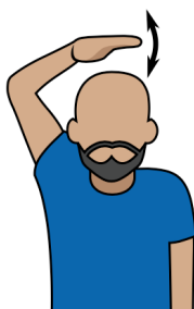
14. Timing Violation "Stall" "Violation"

Right arm extended in front of body, palm facing up and then rotate to palm facing down