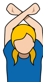
15. Off side "Off side"

Arms crossed overhead in an X, hands closed in a fist