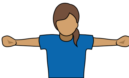
20. Gender Ratio: Women "Gender Ratio: Women"

Hands cupped behind head, elbows out to side