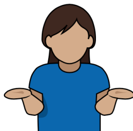
5. Accepted "Accepted"

Two fists bumped together in front of chest, back of hands facing outward