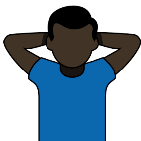
19. Gender Ratio: Men "Gender Ratio: Men"

Hands clasped and raised above head, arms bent