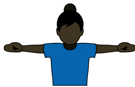
12. Marking Infraction "Fast Count" "Straddle" "Disc Space" "Wrapping" "Double Team" "Vision"

Closed fists, rotate wrists around in a vertical circle