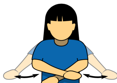
6. Retracted/Play On "Retracted" "Play On"

Forearms extended in front of body, elbows tight against torso with palms facing upwards