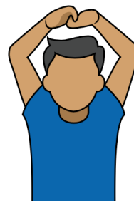
18. Stoppage "Injury" "Technical"

Hands clasped and raised above head, arms bent