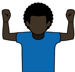
10. Pick "Pick"

Elbow down forearm vertical index finger pointing upward