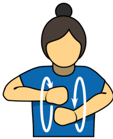
11. Travel "Travel"

Arms raised, elbows bent, fists facing head