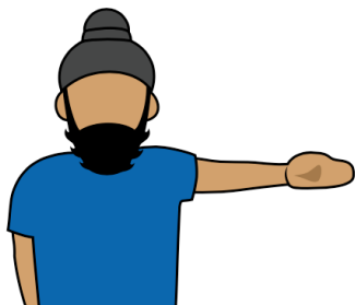
7. In/Out-of-bounds – Out of end zone "In" "Out"

Sweeping crossover motion with both arms extended down in front of body