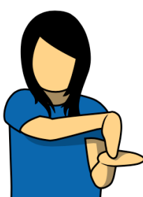
17. Spirit Stoppage "Spirit Stoppage"

Form a T with the hands, or a hand and the disc