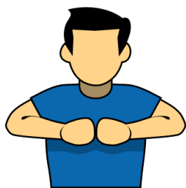
4. Contest "Contest"

Raise both arms, fully extended, straight up, palms facing inward