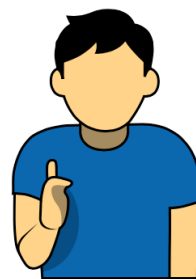
9. Disc up "Up"

Index finger straight arm pointing down at 45 degree