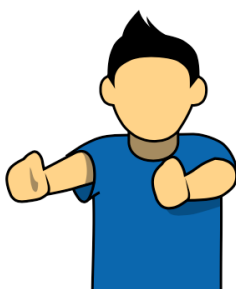
23. Who made the call "Called by Offence/Defence"

Both arms pointing straight up to the left, palms facing down