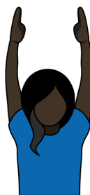
3. Goal "Goal"

Hands above head forming a V, closed fists