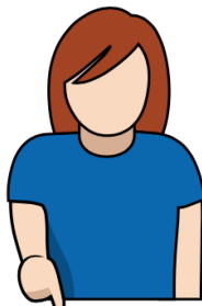
8. Disc down "Down"

Point with one arm extended, flat palm, thumb parallel to fingers, towards playing field (in) or away from playing field (out)