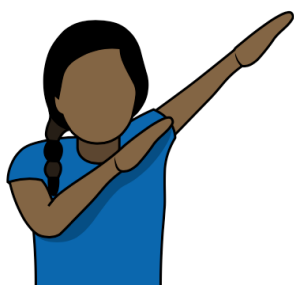
22. Match Point "Match Point"

Wave both extended arms crosswise overhead