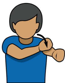
1. Foul "Foul"

Hold one arm straight out and chop the other forearm across the straight arm