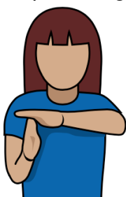
16. Time-out "Time-out"

Arms crossed overhead in an X, hands closed in a fist