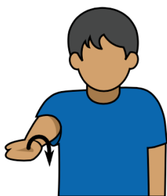
13 Turnover "Turnover"

Right arm extended in front of body, palm facing up and then rotate to palm facing down