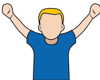
2. Violation "Violation"

Hold one arm straight out and chop the other forearm across the straight arm