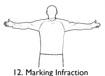
"Fast Count" "Straddle" "Disc

Closed fists, rotate wrists around in a vertical circle