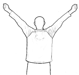
2. Violation "Violation"

Hold one arm straight out and chop the other forearm across the straight arm